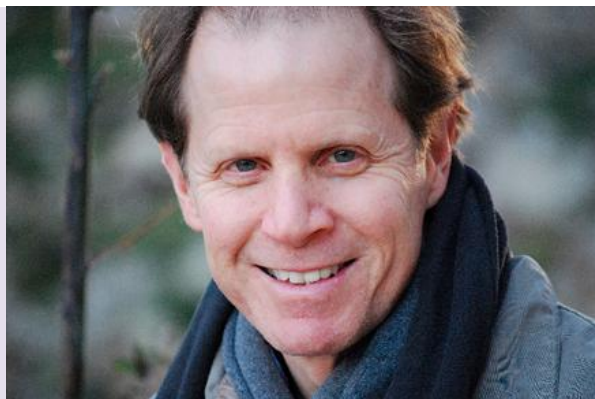
Dr. Daniel Siegel

This year marks the 10th anniversary of the Attachment Network of Manitoba and Nov 20 and 21, we will be hosting a two day conference at the Caboto Centre in Winnipeg. We are pleased to announce that Dr. Daniel Siegel, noted author, speaker and psychiatrist, will be providing a one day talk linking his vast knowledge of the brain, attachment and how we connect with one another. Dr. Siegel speaks all over the world, and we are pleased to be one of his rare Canadian appearances. The second day will be full of mini sessions for people to choose from on a variety of issues as attachment is moved from theory and into practice. We are pleased to see so many colleagues from across Canada and the USA coming to join us to present here, in the heart of the Continent.