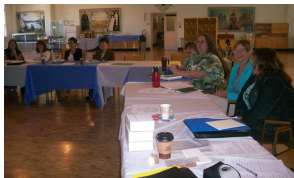
COS trainees at Phase 1 last September