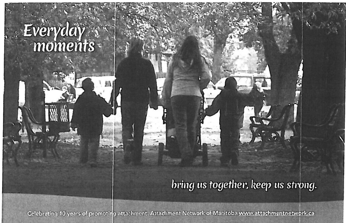
This is the Public Awareness Poster developed by the Attachment Network of Manitoba