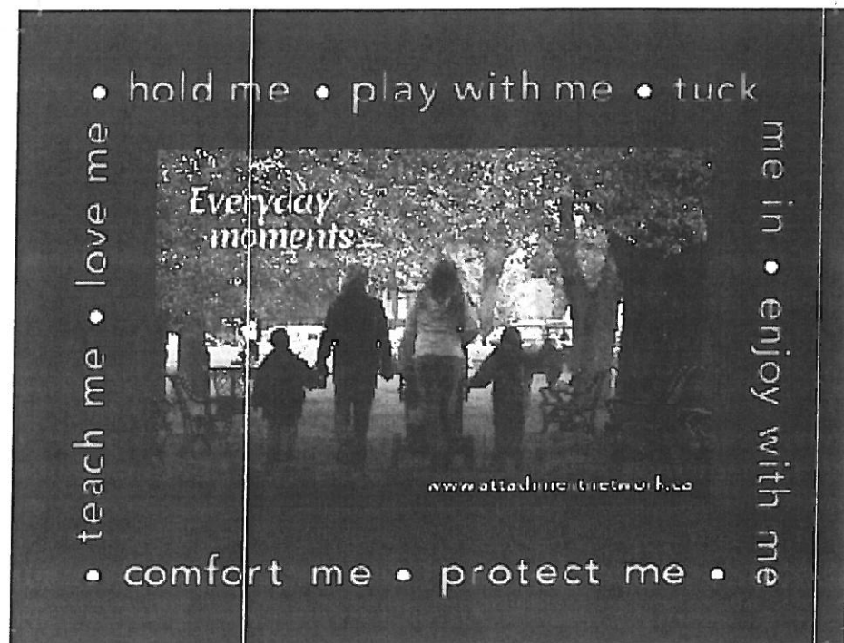
This is the Public Awareness Fridge Magnet.